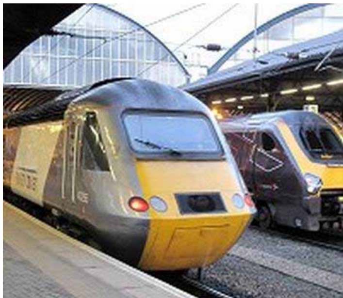
When using Network Rail's 'real' delay figures, 67% of trains were found to have run on time in the last year