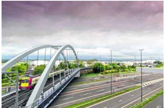
The decision to scrap the Glasgow Airport Rail Link plan has sparked heated debate in the Scottish Parliament

THE Scottish Government has been accused of incompetence over the sale of land that was previously bought for the Glasgow Airport Rail Link.