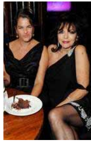
Old school glamour at Mahiki with Joan Collins and friends