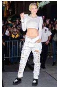
Worst dressed celebrities: Who dressed like a dog's dinner this week? We show and tell...