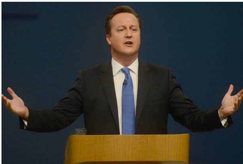
Fares cap: David Cameron