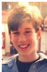
Name the stars before they were famous