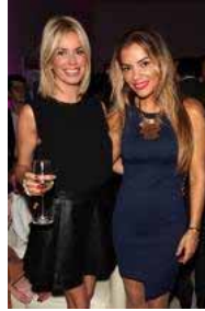
Party people - the stars out in London