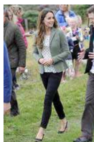
Polished to perfection... how the Duchess of Cambridge turned into a style icon