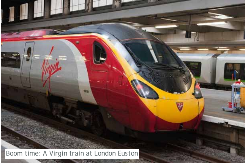
Boom time: A Virgin train at London Euston