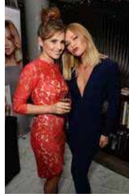
Party people - the stars out in London