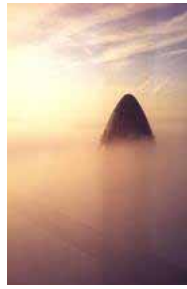
In pictures: Autumn is nearly here - Londoners wake up to a misty morning