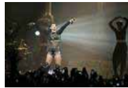
News pictures of the day