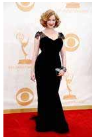
The glitz, the glamour, the best and worst dressed at the Emmys