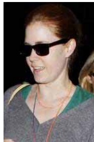
Bare-faced: celebrities snapped without their make-up