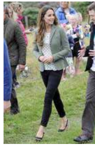
Polished to perfection... how the Duchess of Cambridge turned into a style icon