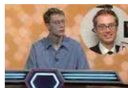
Name the stars before they were famous