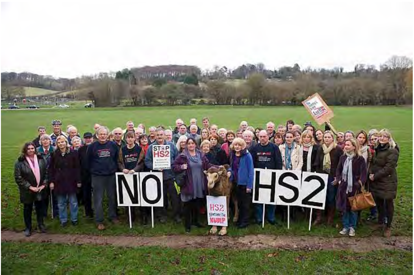
Neighbours in Great Missenden gather to protest against the HS2 route through their village

'I don't think this is quite an election loser across the country yet, but if I were in Cabinet I'd be asking a lot of questions, because the more we look at this, the more unfeasible it is.'