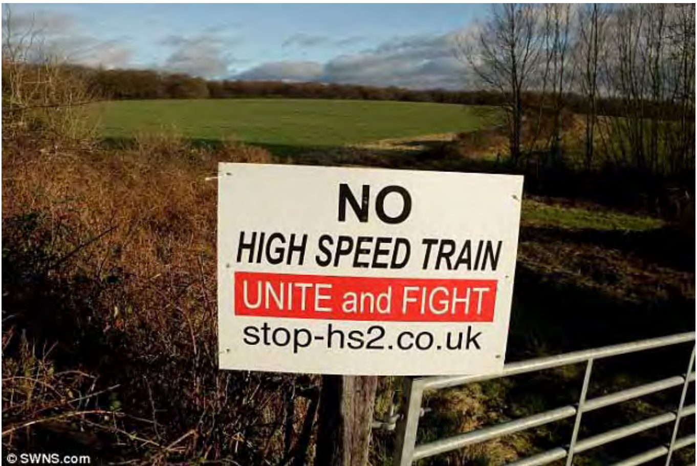
A field in Cubbington, Warwickshire, where a plaque has been put up. The village predates the Domesday Book and will be blighted by lorries during construction and train noise afterwards

And a report published today by the Institute of Economic Affairs (IEA) found the project's costs have been vastly underestimated. It set the real price tag at £80billion, concluding it offers 'incredibly poor value for money'.