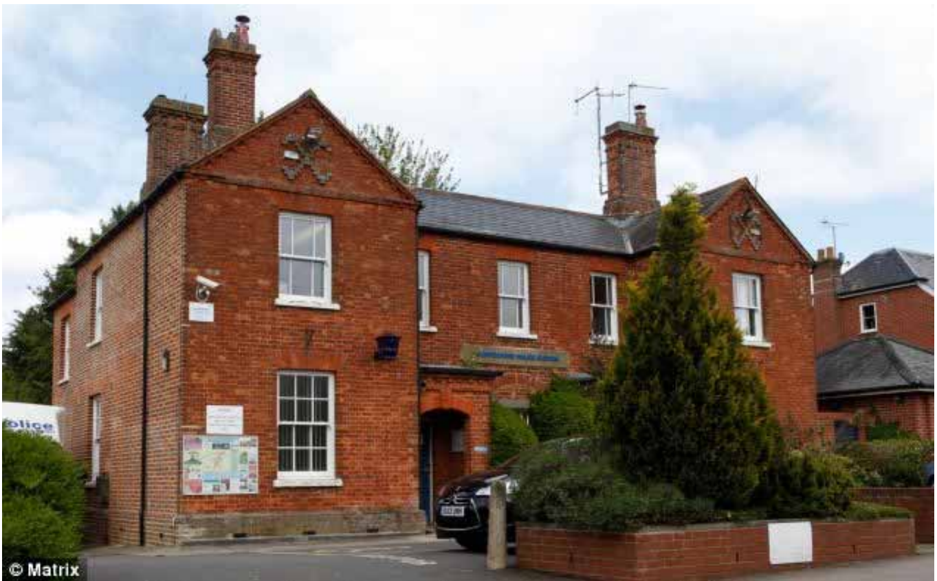
Sham office: Stansfeld used to briefly check in at Hungerford Police Station

Discussing the setting up of the Hungerford office, Tim Starkey, who stood for Labour in November's PCC election, said: 'It looks like it was done purely to maximise his travel claims.'