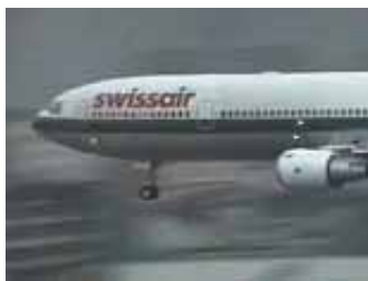
• WATCH: Incredible near miss at Kai Tak airport