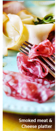
Smoked meat & Cheese platter

For your chance to win a £50 M&S Gift Card each week