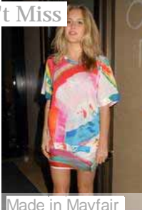
Made in Mayfair