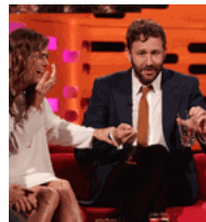
This cheeky chap was on the ball long before he met Posh. Name the stars before they were famous