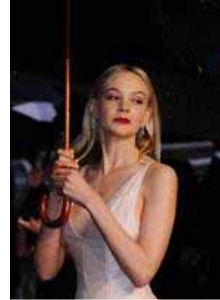
The Great Gatsby