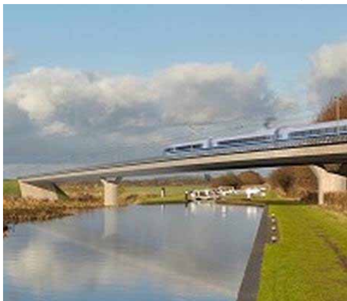
The Birmingham and Fazeley viaduct, part of the new proposed route for the HS2 high speed rail scheme