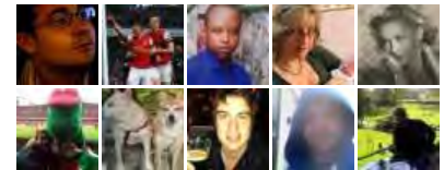
Facebook social plugin

30,257 people like London Evening Standard.