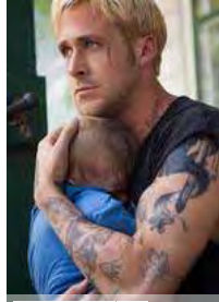
Life of Ryan