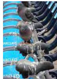
News pictures of the day