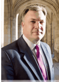
Ed Balls's London