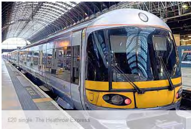
£20 single: The Heathrow Express