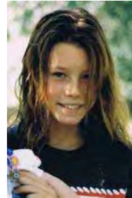
Bare-faced: celebrities snapped without their make-up