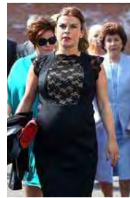
The way they were: stars before they were famous

A southern (Airtrack) route from T5 to Staines would have no level crossings It was proposed to run alongside the M25 to where it would join the Staines / Windsor & Eton Riverside railway allowing it to access a re-built Staines station.