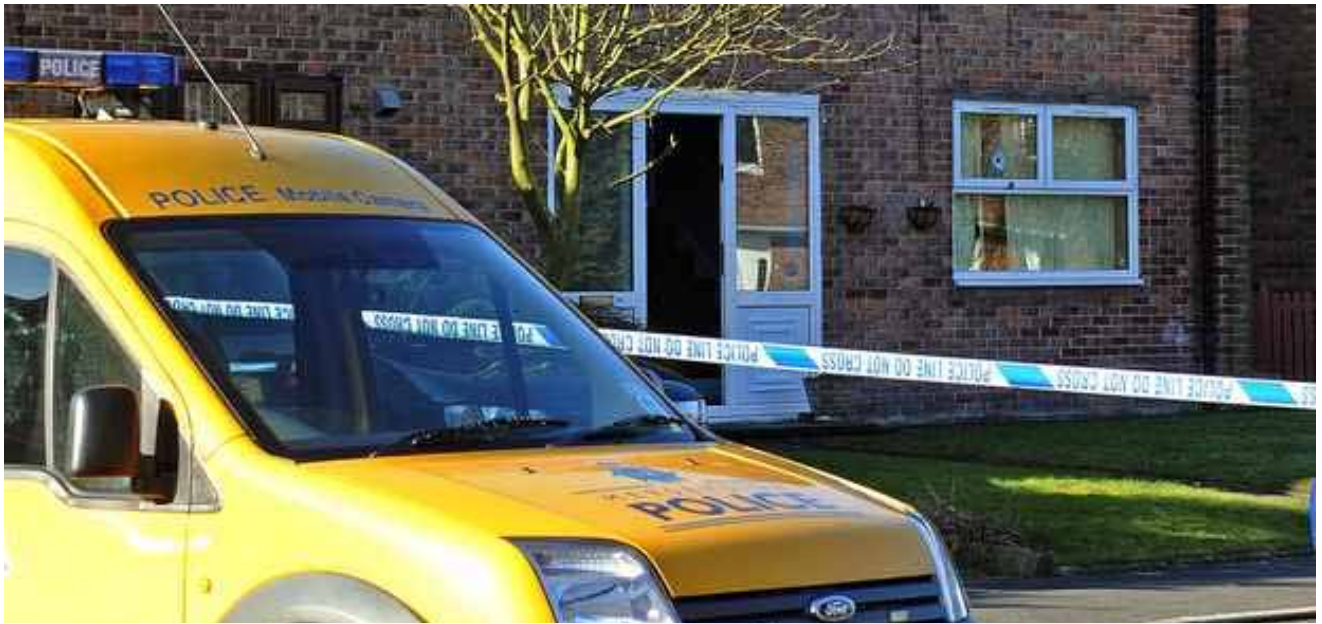
Shots were fired at a house on Parkbourn Square, Maghull