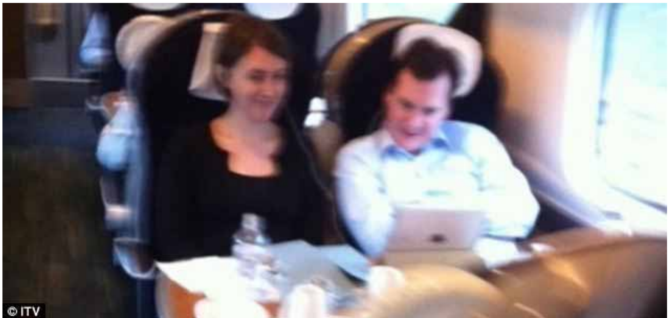
Fan of first class: Chancellor George Osborne was famously caught out by ticket collectors after he refused to move to standard class last year, despite not having a first class ticket

And First Great Western are doing a roaring trade in nostalgic middle aged railway fans travelling first class just to recreate their own golden age of travel on Pullman Carriages with a full silver service meal option.