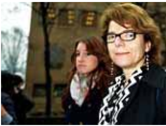
• The price of vengeance: Couple will be reunited in the dock...