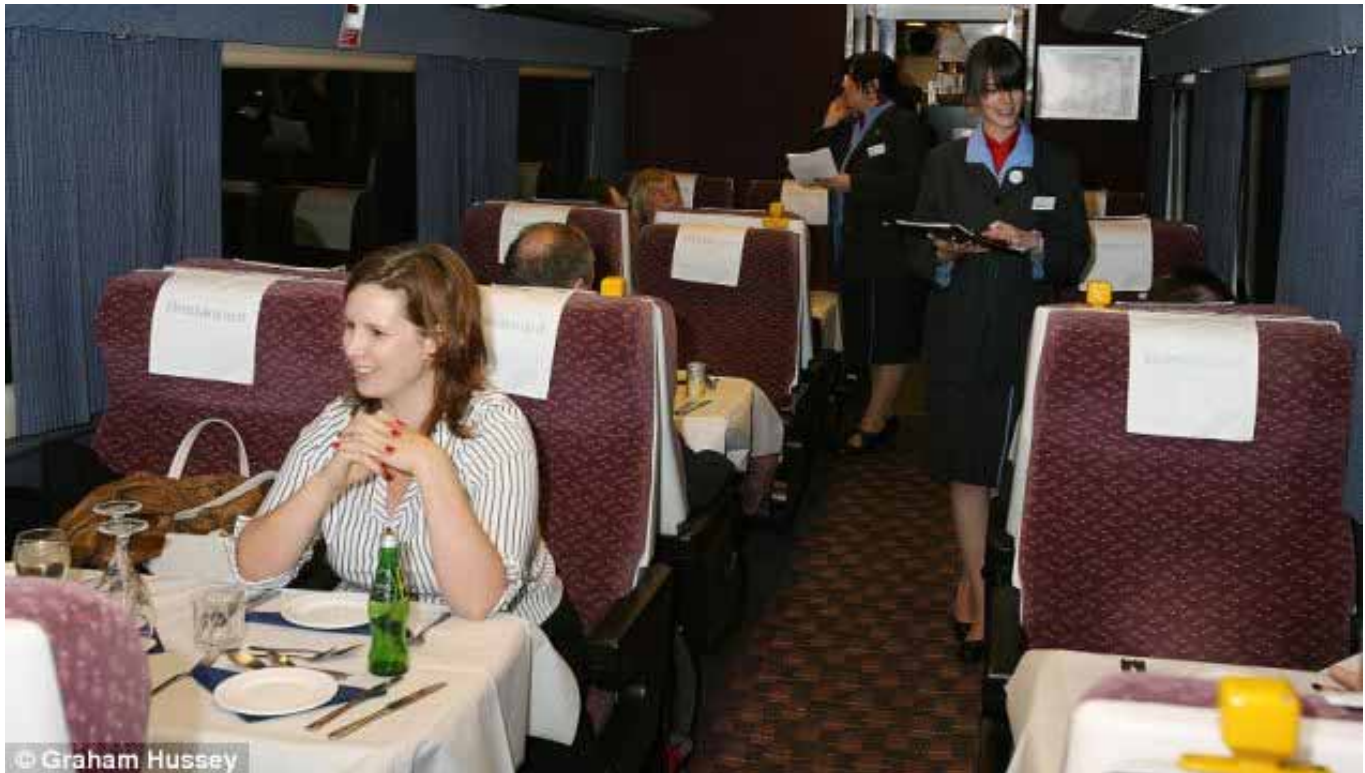
Living the high life: Despite the recession, first class travel is proving popular, as in this restaurant car on the train from London's Liverpool Street station to Norwich

Yet the modern first class passenger is more likely to be a student, football fan or on a stag or hen party than the upper class image from films like Brief Encounter .