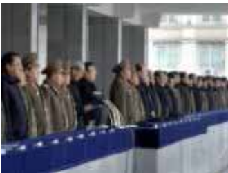
• 'We're fully capable of defending ourselves': U.S. dismisses...