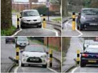
• Motorists' anger at council as it installs bollards just...