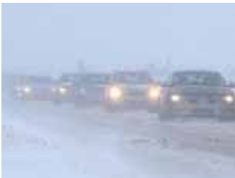
• Another blast of cold weather to sweep in this weekend...