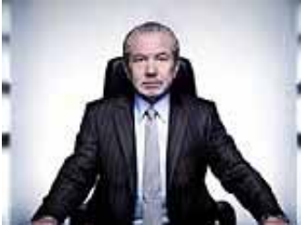
• 'Lord' Alan Sugar: the rudest man in Britain