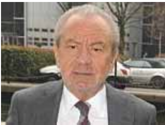
• 'Stella wants money but I won't give into blackmail': Lord...