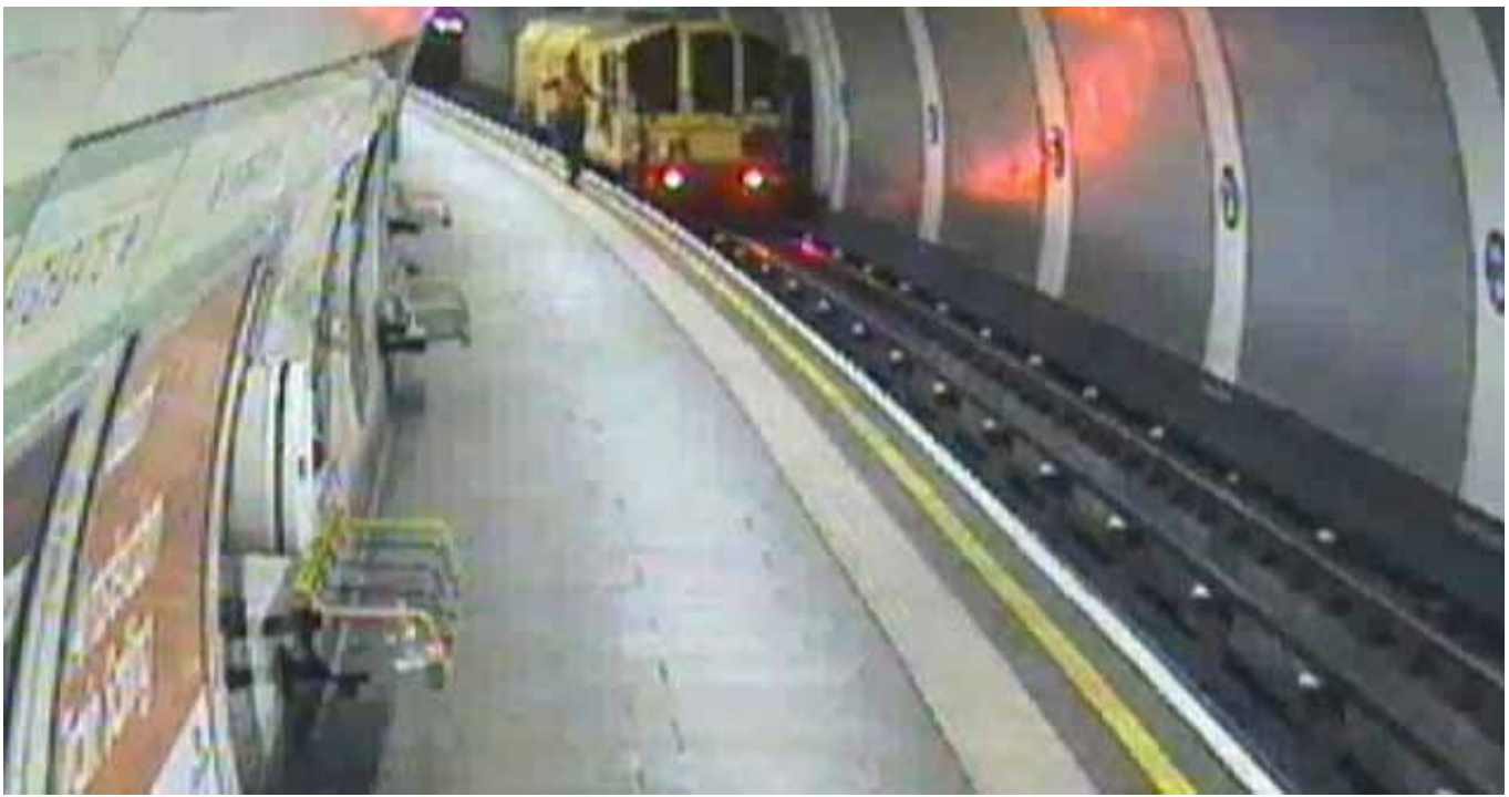
Worrying: This is the dramatic moment a Tube worker jumps off a 39-tonne runaway train as it careered dangerously through Highgate station in north London