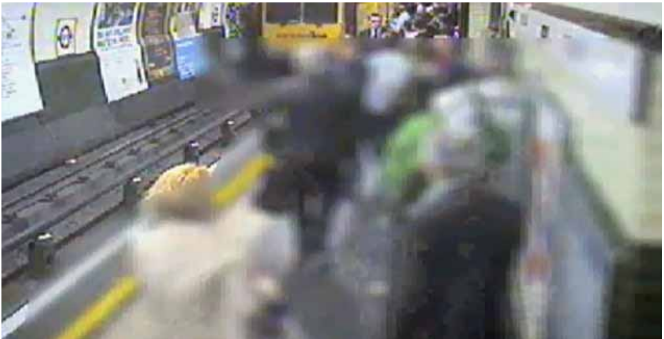
Awful: A court heard yesterday how the runaway train came within 2,000ft of causing a 'terrible tragedy' after tearing along four miles of track