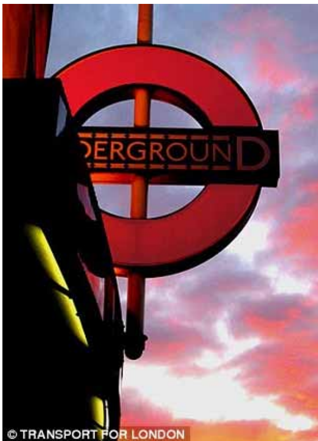
In court: London Underground has been fined over the incident along with two of its contractors

He told the Old Bailey that the broken down unit came loose as it was being towed uphill past Highgate station at 6.35am on August 13, 2011. A defective coupling on the unit came loose and because the unit had no power it couldn't brake.