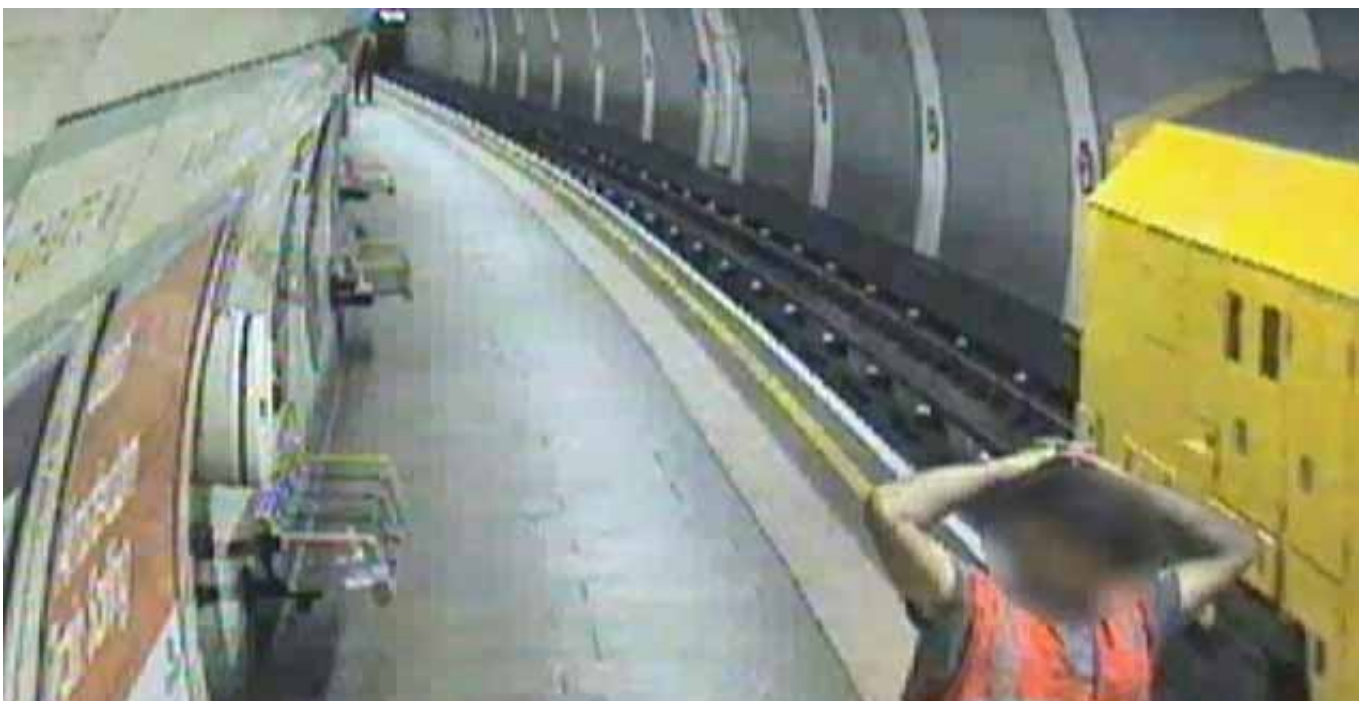
Out of control: The man puts his head on his hands as the train hurtles through the underground

London Underground and its contractors were yesterday fined £300,000 at the Old Bailey over the incident in August 2011.