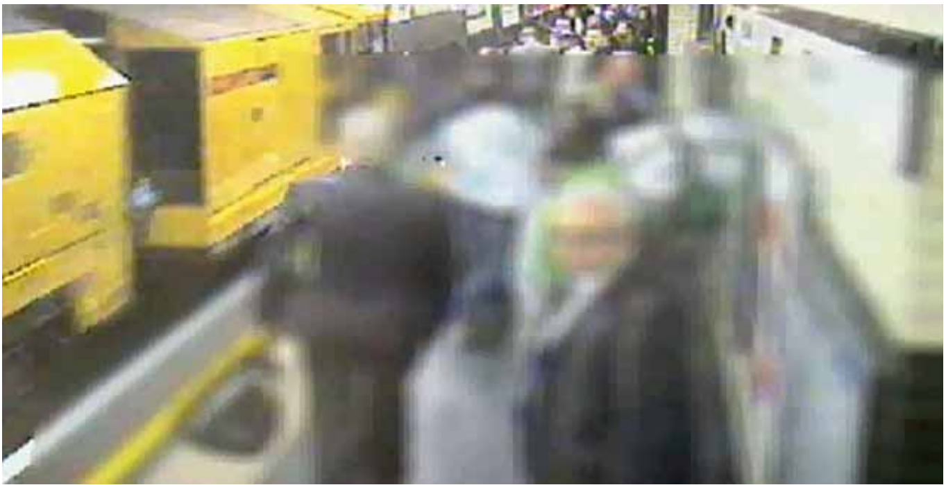
Concern: Commuters waiting during the busy rush hour period at Archway station look on in bemusement as the out of control train hurtles past them