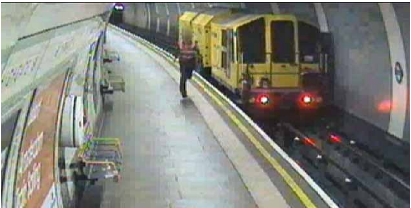
Dangerous: The man can be seen jumping to safety on the platform as the 66ft-long maintenance unit tore along the Northern Line after its brakes failed