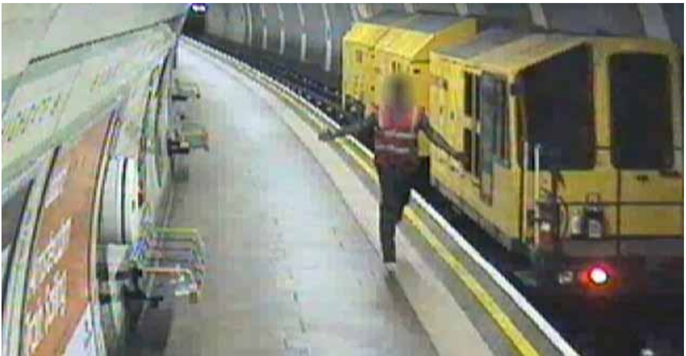
Panic: The Tube worker is clearly worried about the out of control train as it hurtled towards Archway station