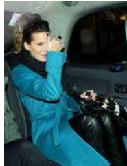
News pictures of the day