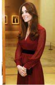
Party people - the stars out in London