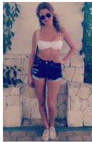
Polished to perfection... how the Duchess of Cambridge turned into a style icon