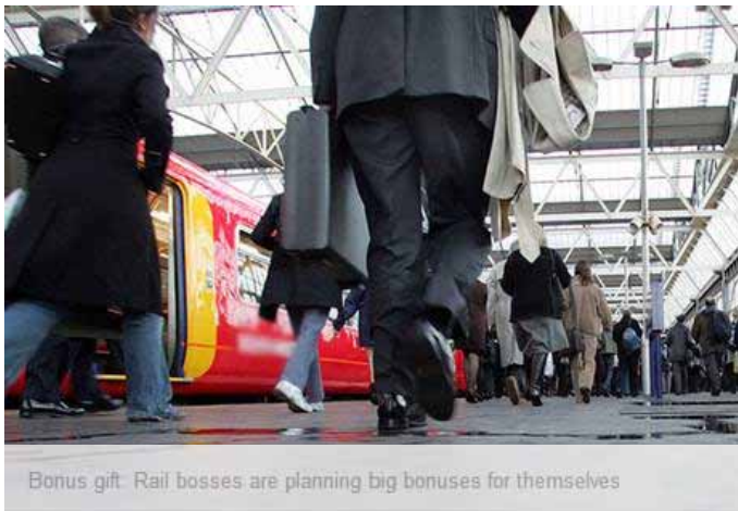
Bonus gift: Rail bosses are planning big bonuses for themselves