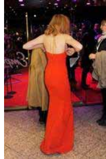
Polished to perfection... how the Duchess of Cambridge turned into a style icon