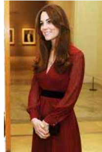
News pictures of the day