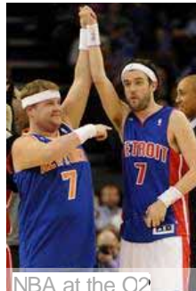
NBA at the O2