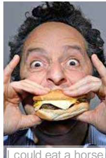
I could eat a horse