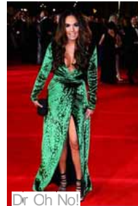
Dr Oh No!