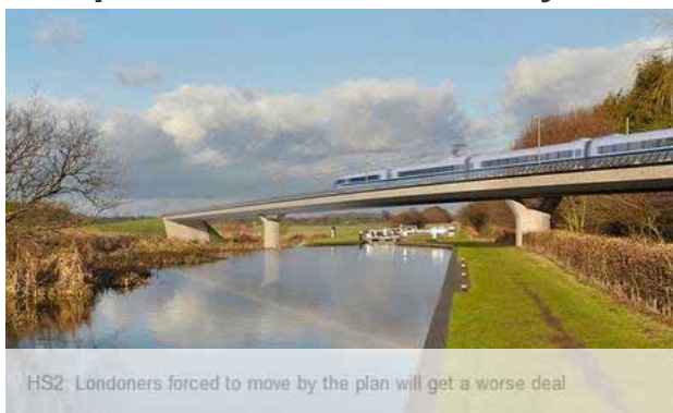
HS2. Londoners forced to move by the plan will get a worse deal