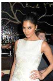
Polished to perfection... how the Duchess of Cambridge turned into a style icon