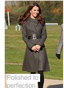
Polished to perfection