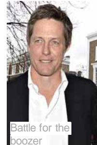
Battle for the boozier